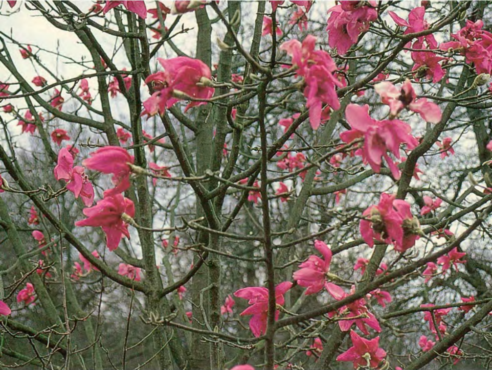
Fig. 11 Mr Urtwin-Smith's seedling from Magnolia campbellii subsp. mollicomata 'Lanarth'. (See pp.45 and 52.)