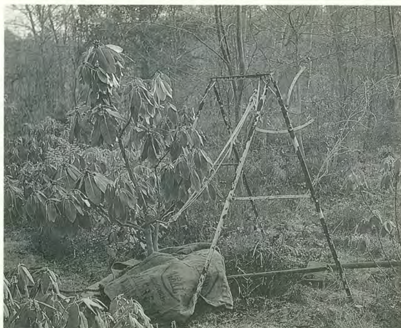
Fig. 4 The 'contraption' and a rhododendron ready to be transported