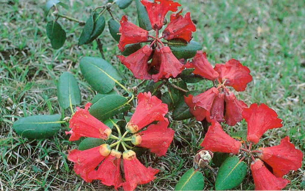
Fig. 9 Variation in Rhododendron thomsonii . (See 'Nepal 1985', p.63.)