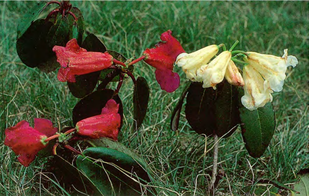
Fig. 7 Rhododendron campanulatum × R. thomsonii (left) and R. campanulatum × R. campylocarpum (right). (See 'Nepal 1985', p.61.)