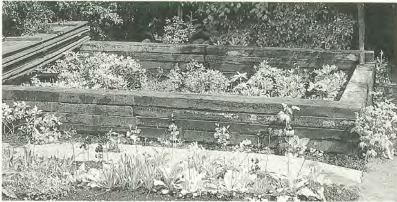
Fig. 2 Protected area, 20 × 10 feet, with spruce branches removed, covers off and showing spring growth Dr R. H. L. Jack

across the top. This is the first stage of protection against early frosts. The plants have light and air and can harden-off fully. In late December dry beech leaves are spread to give a soil covering before the final degree of protection is added. This is a close covering of green Norway spruce branches. Any evergreen conifer would serve equally well. Inside is now darkened as well as insulated around and above but there is free access of air under the panels at the sides as the illustration shows. The aim is to cushion the severity of temperature changes and in particular to protect from low temperatures. In this there is a good measure of success.