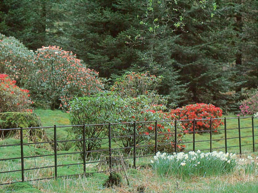
Fig. 5 Rhododendrons at Strone