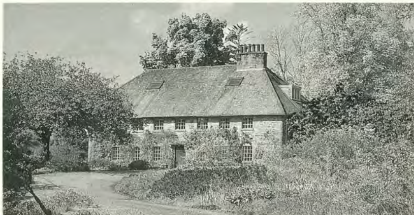
Fig. 1 Strone House, which lies above the woodland garden.